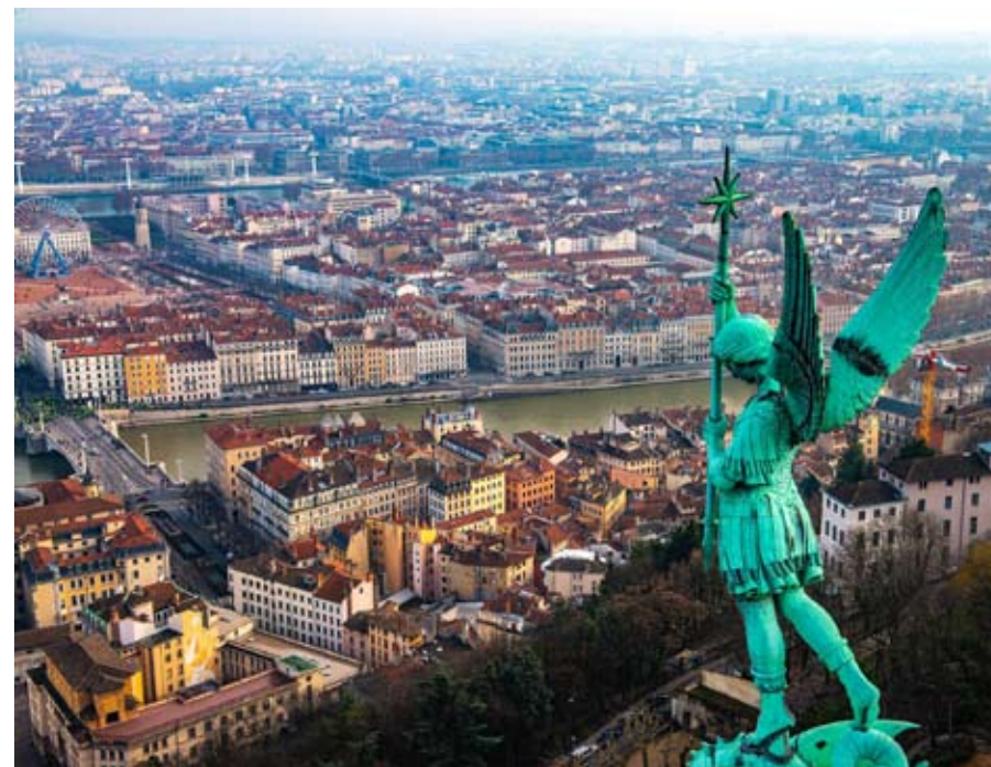
Overview of Lyon from Fourvière Basilica

A 2000-year-old city, Lyon is the capital of the Auvergne Rhône Alpes region and is considered a gateway to the French Alps. Renowned also as the World Capital of Gastronomy, visitors can choose from a selection of traditional eateries known as bouchons, Michelin starred restaurants and brasseries. Lyon has also been recognised as the “European Capital of Smart Tourism” in 2019.