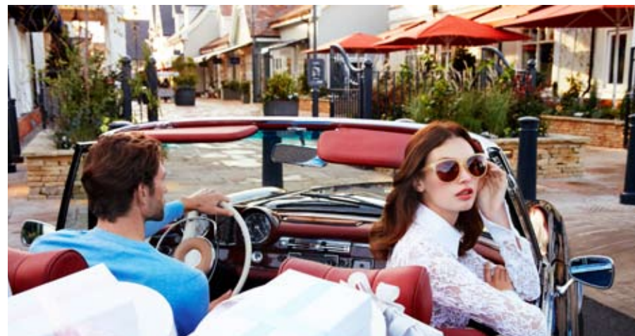
La Vallée Village

Enjoy sublime shopping at chic department stores such as the Galeries Lafayette, Printemps located on the Boulevard Haussmann, the Le BHV Marais, le Bon Marché Rive Gauche and the Printemps du Louvre.