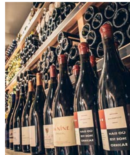
N5 Wine Bar

Raise a toast to wine at N5 Wine Bar which offers more than 3,500 wine references.