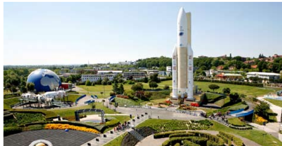
Cité de l'Espace

Aviation history comes alive at the Aéroscopia museum that is located next to the Airbus factory premises. Children can enter a real Concorde, an Airbus 330B and the Super Guppy. Admire a collection of aircraft, go behind the scenes of an airplane, or navigate your own flight with a simulator session.