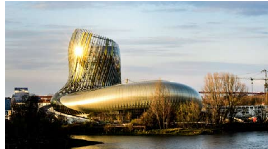
La Cité du Vin