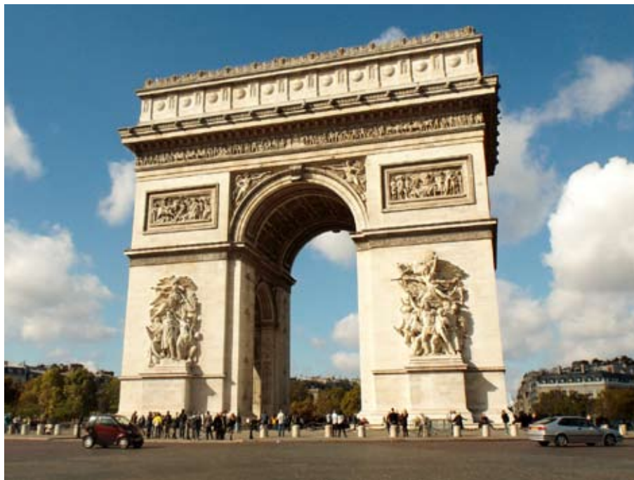
Arc de Triomphe