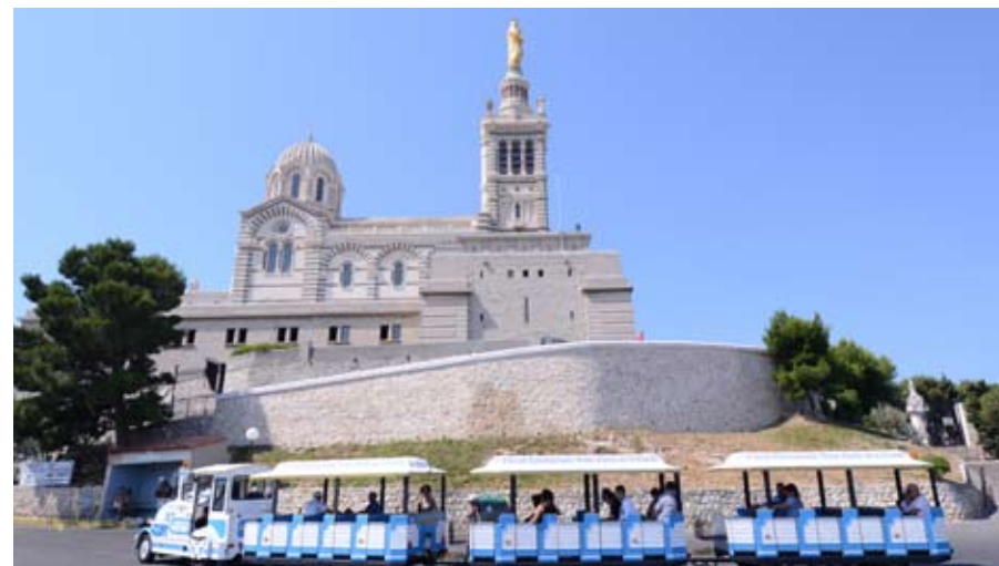
Basilica of Notre Dame de la Garde

Take a boat ride to the legendary and listed historical monument - the Château d'If once a state prison and made famous by Alexandre's Dumas's novel 'The Count of Monte Cristo.'