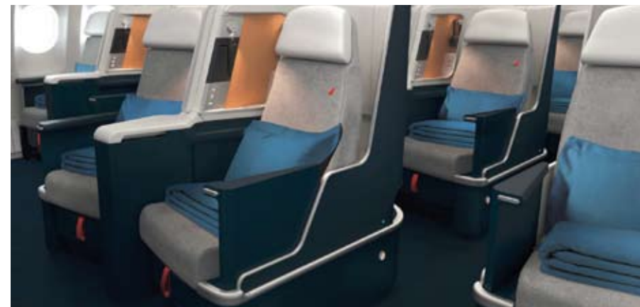
Air France - Business Cabin

This summer, Air France unveiled its revamped long-haul travel cabins on board Airbus A330 on the Bengaluru-Paris and New Delhi-Paris route. With 36 seats in Business, 21 seats in Premium Economy and 167 seats in Economy, Air France offers brand new experience on board. The revamped A330 has a new Business seat that transforms into a full flatbed, one of the widest Premium Economy seats in the market and additional comfort in Economy with 118 degree recline.