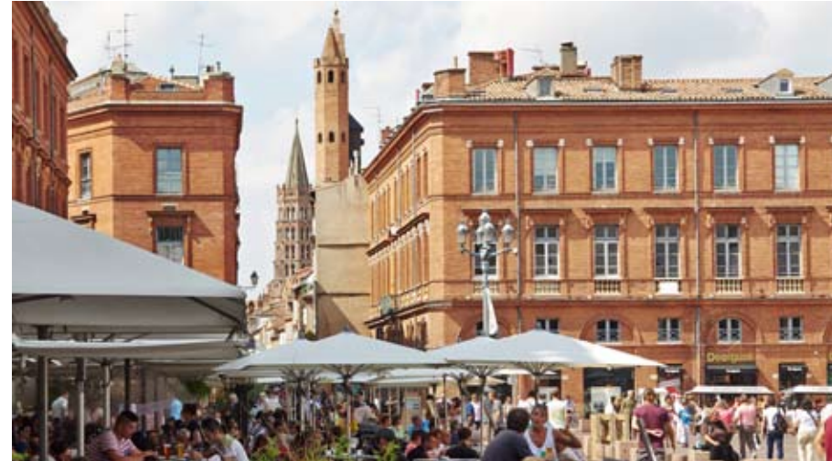
The Capitole Square