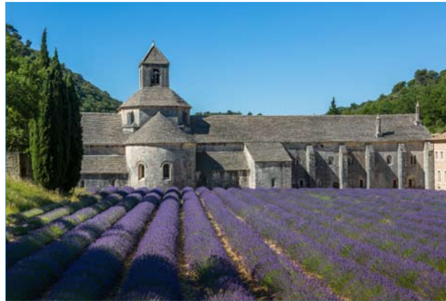
Abbaye de Sénanque

Discover Avignon, once the city of the French popes. The city boasts of historical sites such as the Palais des Papes, the famous Pont d'Avignon (the bridge), its ramparts and churches.