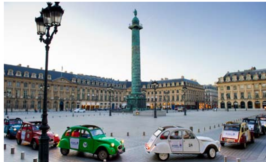
2 CV Rides

When in Paris , visit famous Parisian landmarks, stroll along the quays of the Seine, take a trip through the timeless heart of the city, savour succulent French gastronomy at bistros or brasseries, enjoy retail therapy or spend time discovering typical Parisian districts.