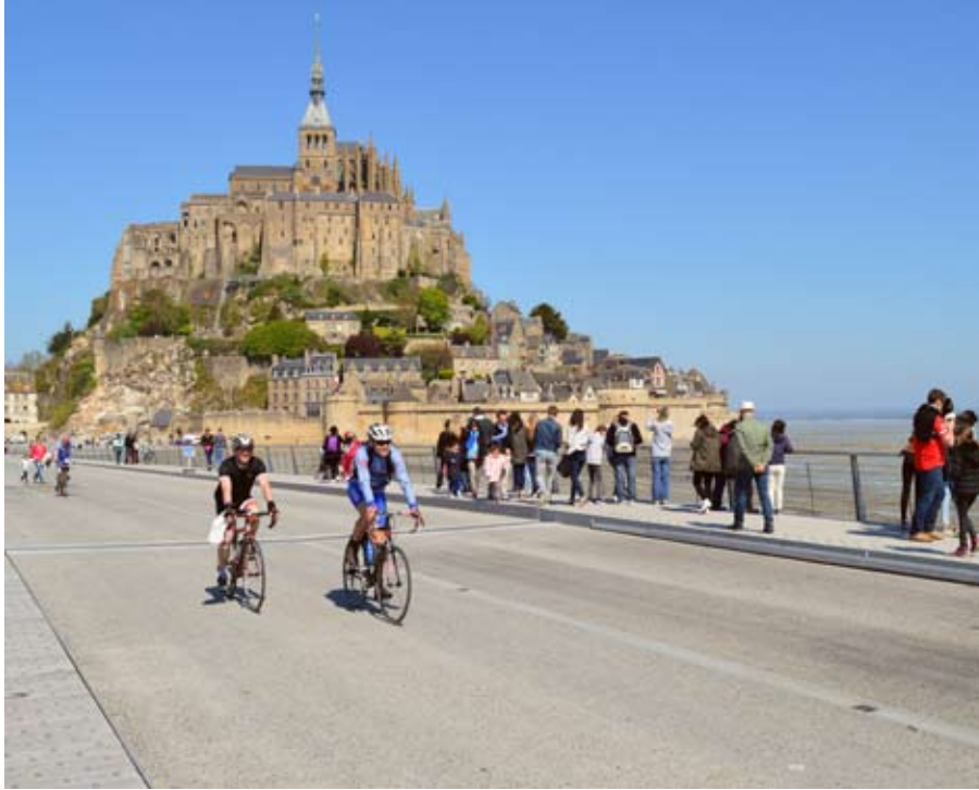
Mont Saint Michel