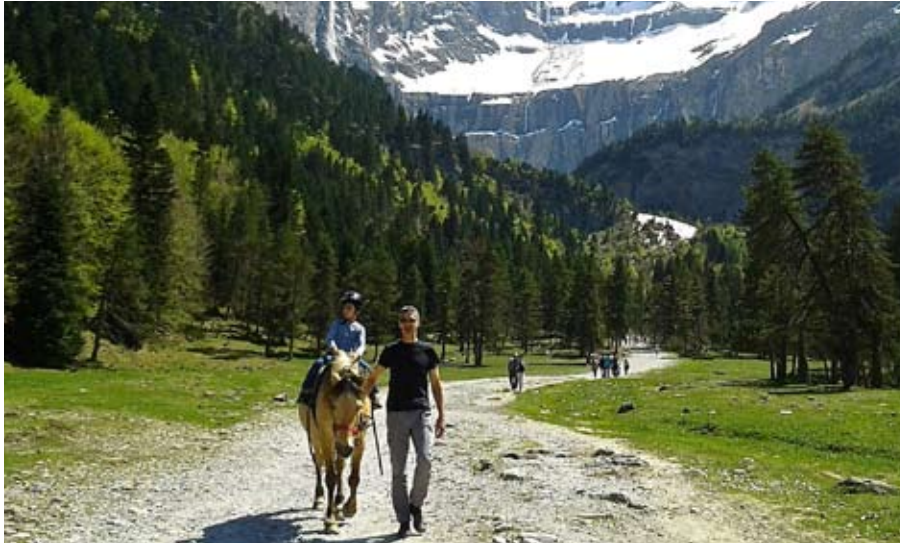
Cirque de Gavarnie

At only 3 hours from Toulouse, discover the grandiose UNESCO classified Cirque de Gavarnie - a natural bowl carved out by ancient glaciers in grey, ochre and pink limestone rocks. Admire Europe's largest waterfall with its 413m vertical drop and permanently snow-covered mountains.