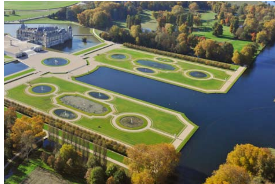
Aerial view of Chantilly Castle

At an hour's distance from Paris lies the magnificent Domaine de Chantilly that is home to the statuesque Château de Chantilly, the Condé Museum and the Grand Stables. Do not forget to try the delectable Chantilly cream that is known all over the world.