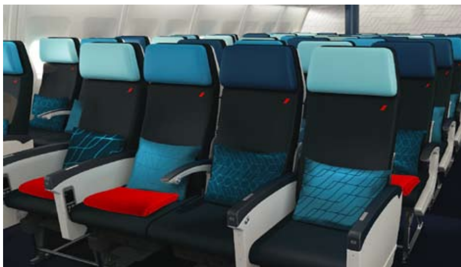
Air France - Economy Cabin

Air France with its robust domestic network, connects to numerous French cities such as Marseille, Lyon, Nice, Nantes, Montpellier and Toulouse to name a few.